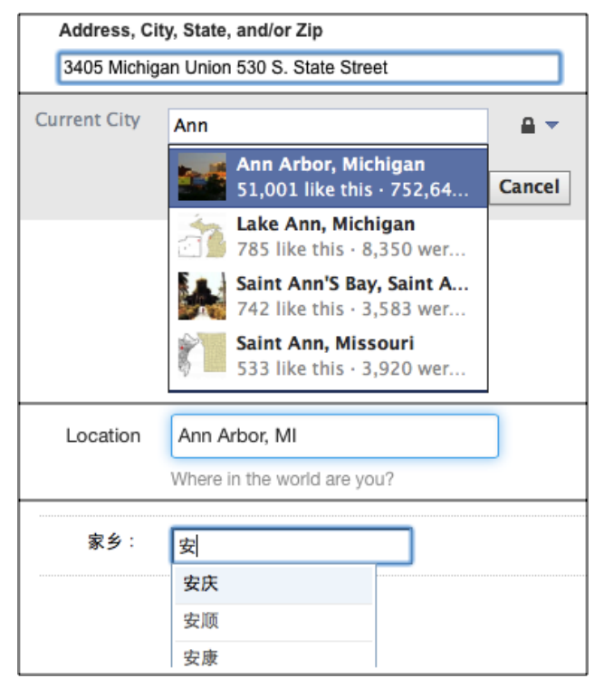
Figure 1. Examples of location fields from a number of online communities (top to bottom: Yelp, Facebook, Twitter, Kaixinwang). Note that all use different prompts, have different lengths, and take different approaches to validation. (Kaixinwang's prompt translates to "Hometown").

Location field entries can also help researchers avoid major confounds introduced by user mobility. Given that a person's geotagged social media (e.g. photos, tweets) may be widely