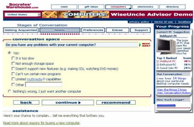
Figure 3: Extract the customer's needs

After this screen the next question is "Do you have any problems with your current computer?" If the buyer answers