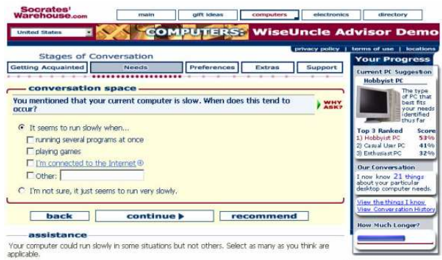
Figure 4: Continue extracting the needs

"Yes" and identifies "Too Slow" as the only problem, then the screen shown in Fig. 4 appears.