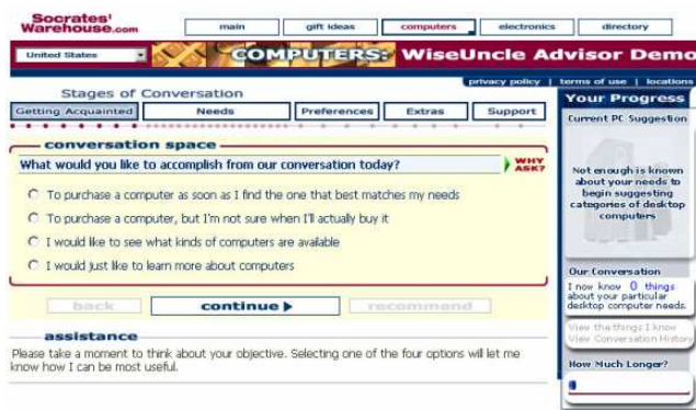
Figure 2: Getting acquainted

Instantiated as a computer advisor, Rubicon shows (Fig. 2) its first screen to a customer. Buyer control is offered, inter alia, by the "Why Ask" button, which pops up a justification for the current question. This feedback also exhibits respect for the buyer's right to know why their time and effort are being spent answering this particular question.